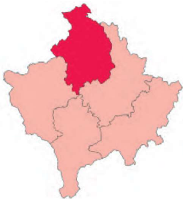
FIGURE 1: Geographical location of northern region in Kosovo.

Several researches have reported the benefit of using various body parameters in predicting standing height, and arm span happened to be one of the most reliable ones in adults (Hickson, Frost 2003, Jalzem, Gledhill 1993, Mohanty et al. 2001, Ter Goon et al. 2011), while foot length measurement is the most reliable predictor during adolescent age, due to the fact that ossification and maturation occurs earlier in the foot than the long bones and standing height could be more accurately predicted from foot measurement as compared to long bones during adolescent age (cited in Singh et al. 2012). In addition, the relationship of long bones and standing height was found to vary in different ethnic and racial groups (Bjelica et al. 2012, Brown et al. 2002, Popovic et al. 2013, 2015, 2016, Reeves et al. 1996, Steele, Chenier 1990) as well as various regions (Arifi 2017, Arifi et al. 2017b, Milasinovic et al. 2016). Hence, researchers have derived a specific formula for calculating standing height from long bones for each ethnic/race group. The mentioned variations might be the case with foot length predictions too, mostly due to the fact that the Dinaric Alps population has specific body composition